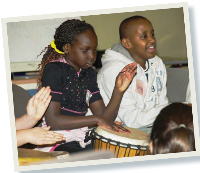
Young people share the energy and fun of drumming as a group during a recent program hosted by The Opportunity Alliance.

SPIRAL Arts offers opportunities to people of all ages and life experiences who are seeking hope, purpose, and meaning, to create art in a supportive, spiritually centered, caring community. It brings opportunities for art making to the people, helping them to discover resources for growth within themselves.